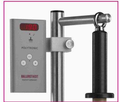
fixture of control unit and suspension