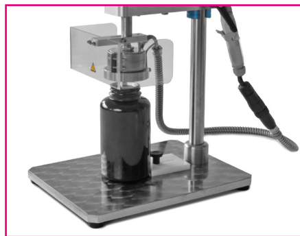
sealing of plastic bottles